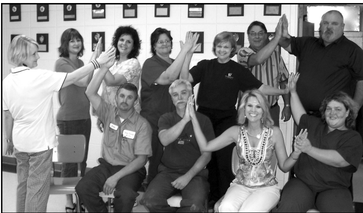
Jones County Vocational School Faculty and Staff hope to reward plenty of “High Fives” to deserving students during the 2007-08 school year.

The student council at the Jones County Vocational Center recently implemented the “High Five” Program to create an atmosphere of character and respect and encourage students to demonstrate employability skills. This is an ongoing program that has been embraced by the vocational faculty, staff, and students. This program rewards students for upholding five values that are encouraged throughout the year – good work ethic, punctuality, leadership, citizenship, and spirited attitude. When faculty and staff see someone going above and beyond in one of these five areas, they reward them on the spot and give them a “High Five” reward. The student council selected a personalized lapel pin to serve as the reward. The “High Five” pin shows recipients that their actions are noticed and