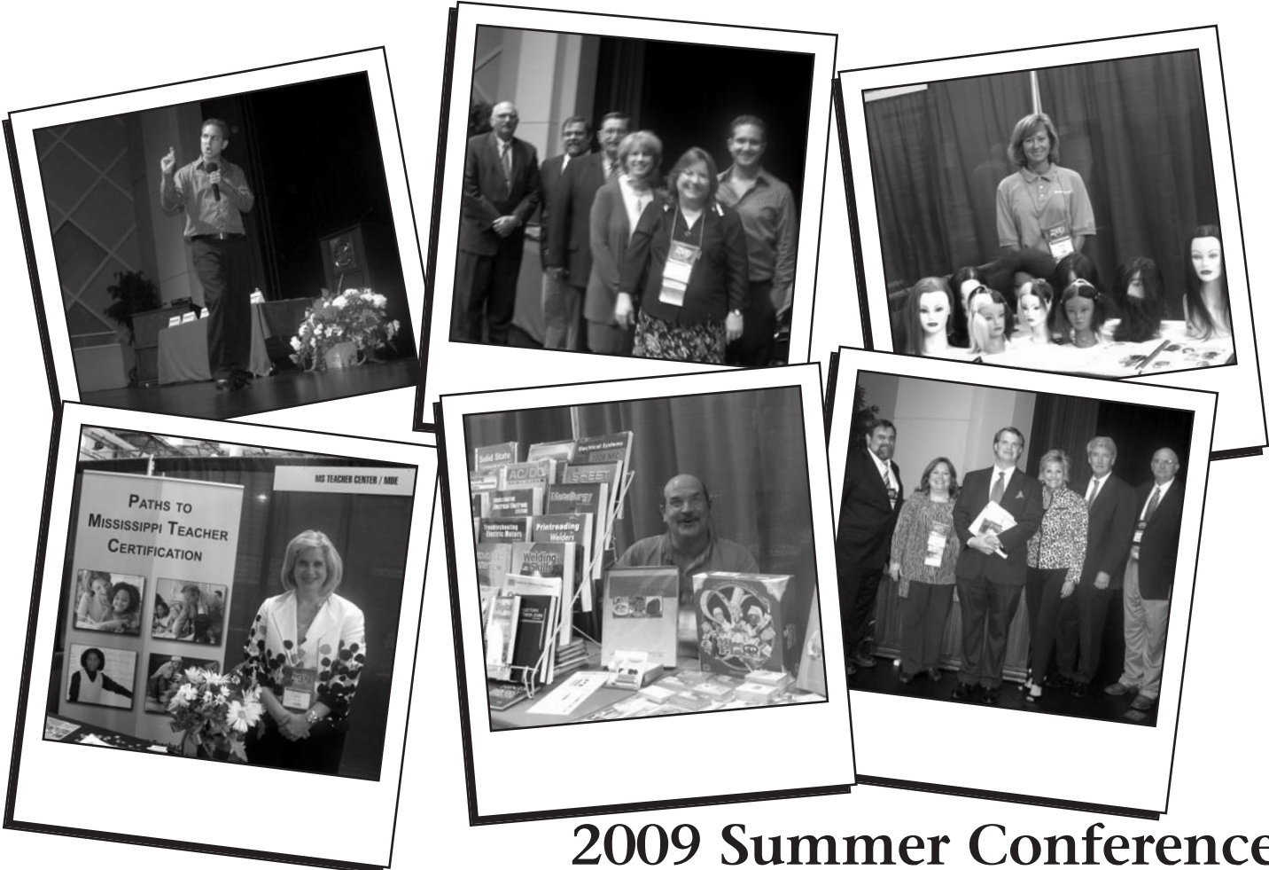
2009 Summer Conference

PRSR STD U.S. POSTAGE PAID JACKSON, MS PERMIT # 1005