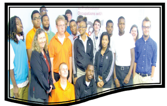
CTC students learn about careers associated with engineering at CAVS.

Students were introduced to college and military recruiters and they had the opportunity to ask questions about future studies and careers in the engineering field.