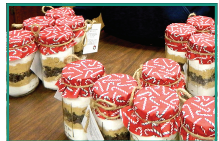
“Gift in a Jar”