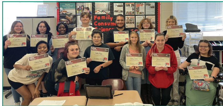
(top) Child Development students show off their Hands Only CPR Credentials