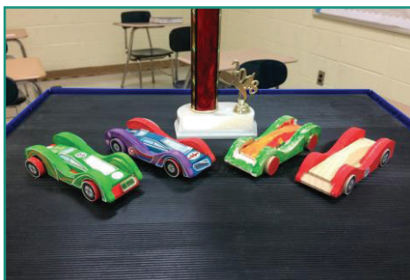
Collision Repair Students painted wooden model cars